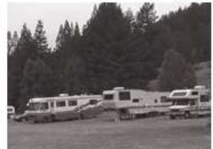
RV's and Tent Campers Welcome

Accommodations: You could make a vacation around this event. Self-contained RVs and tent campers are welcome to set up from 6/24 - 6/29. Campfires only in designated areas. There are no 120v hookups but there are chemical toilets in the meadow. Restrooms at the degree site have a hot water shower in the men's, available to women. Motels and rental RV's are available at the coast, 30 minutes on a dark and winding road from the RAM site. Call as soon as possible for your reservations, it's a popular tourist area.