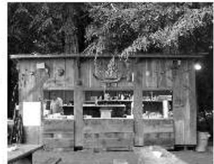
Comptche Cook Shack

TRADEWINDS LODGE (707) 964-4761 SURF MOTEL (707) 964-5361 SURREY SUPER 8 (800) 206-9833 FOOLS RUSH INN (707) 937-5339 HARBOR LITE LODGE (707) 964-0221 SEA FOAM LODGE (707) 937-1827 RESERVE EARLY!! COAST VACATION TRAILORS (707) 962-9294